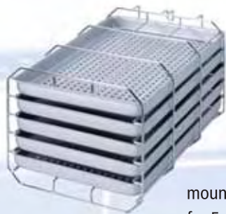
mounting „A“ for 5 trays

The autoclaves are always delivered with a mounting for trays or cassettes, included in the price, with the standard combined mounting "A" (for 5 trays or 3 standard tray cassettes). The optional package holder allows the vertical sterilization of sealed items for optimal drying results.