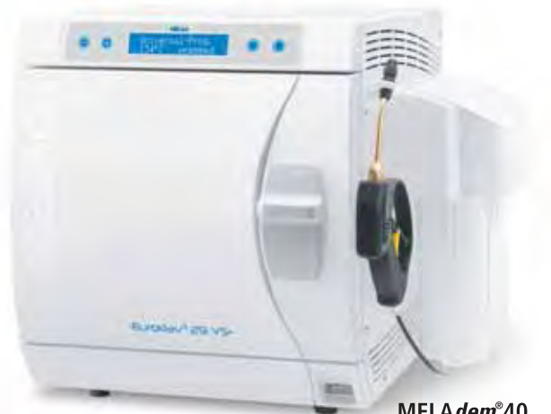
MELAdem®40 mounted on the Euroklav® 29 VS+

Operating the autoclaves should be both pleasurable and safe. The design fully supports this demand. It shows what's essential, and does its work efficiently. The large door lock is not only a design feature, but also ensures a safe and easy opening and closing of the door.