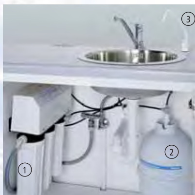
MELAdem®47 (1) installed in a sub cabinet with water tank (2) and additional tap (3).