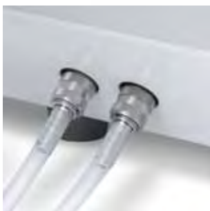
quick release connector

The large integrated funnel-shaped opening of the water storage tank makes it easy to fill the tank with demineralized or distilled water in the Euroklav® 23 S+, 23 VS+ and 29 VS+. Alternatively, both autoclaves could be fed the required water supply from any external reserve vessel or even be connected to a water-treatment unit.