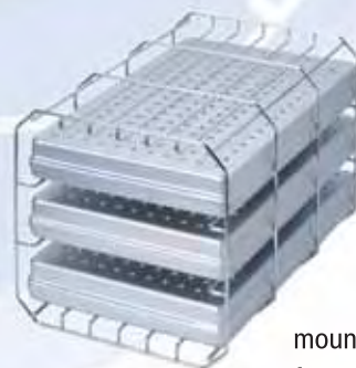
mounting „A“ (rotated) for 3 standard tray cassettes